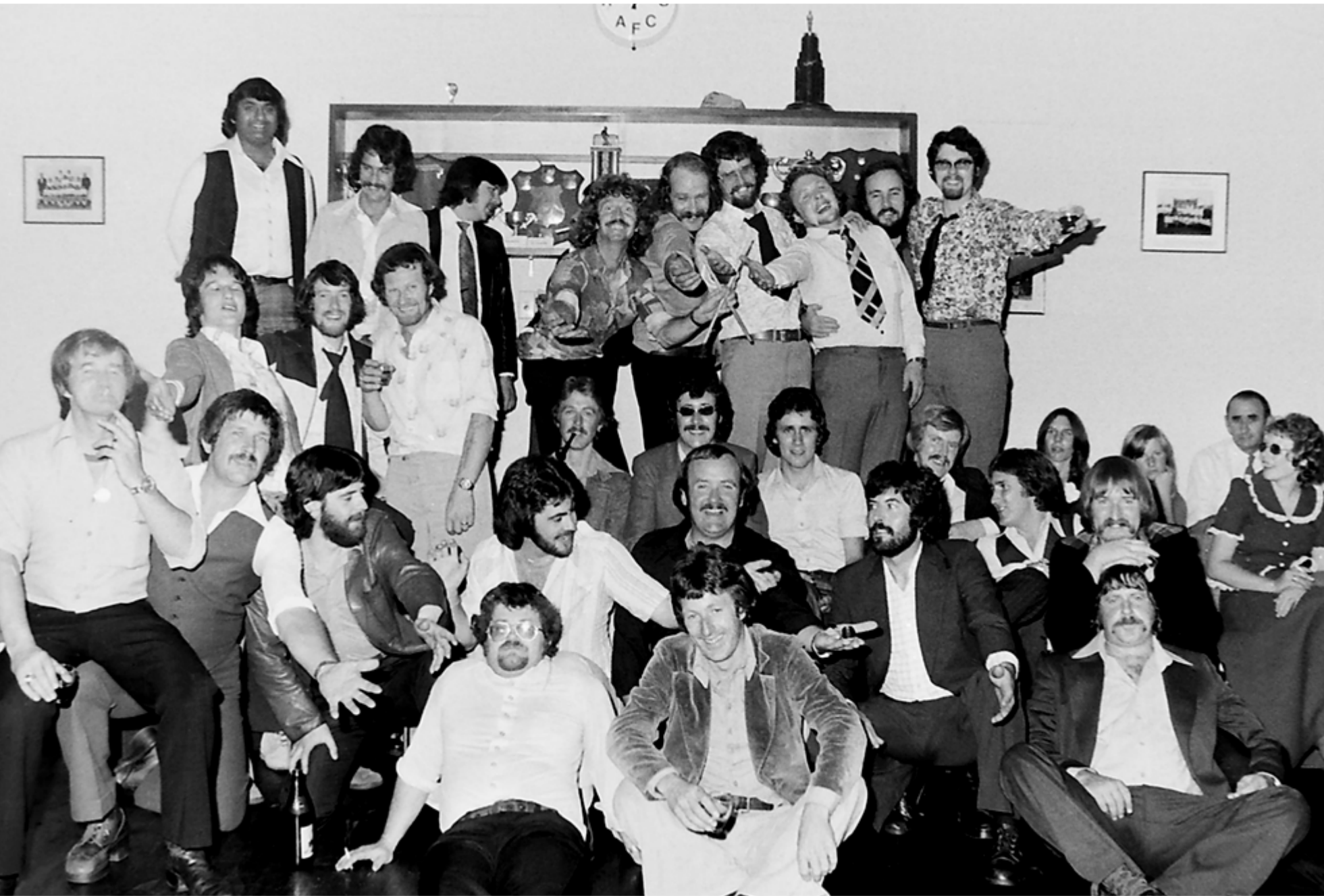
Christchurch musicians, March 1977.