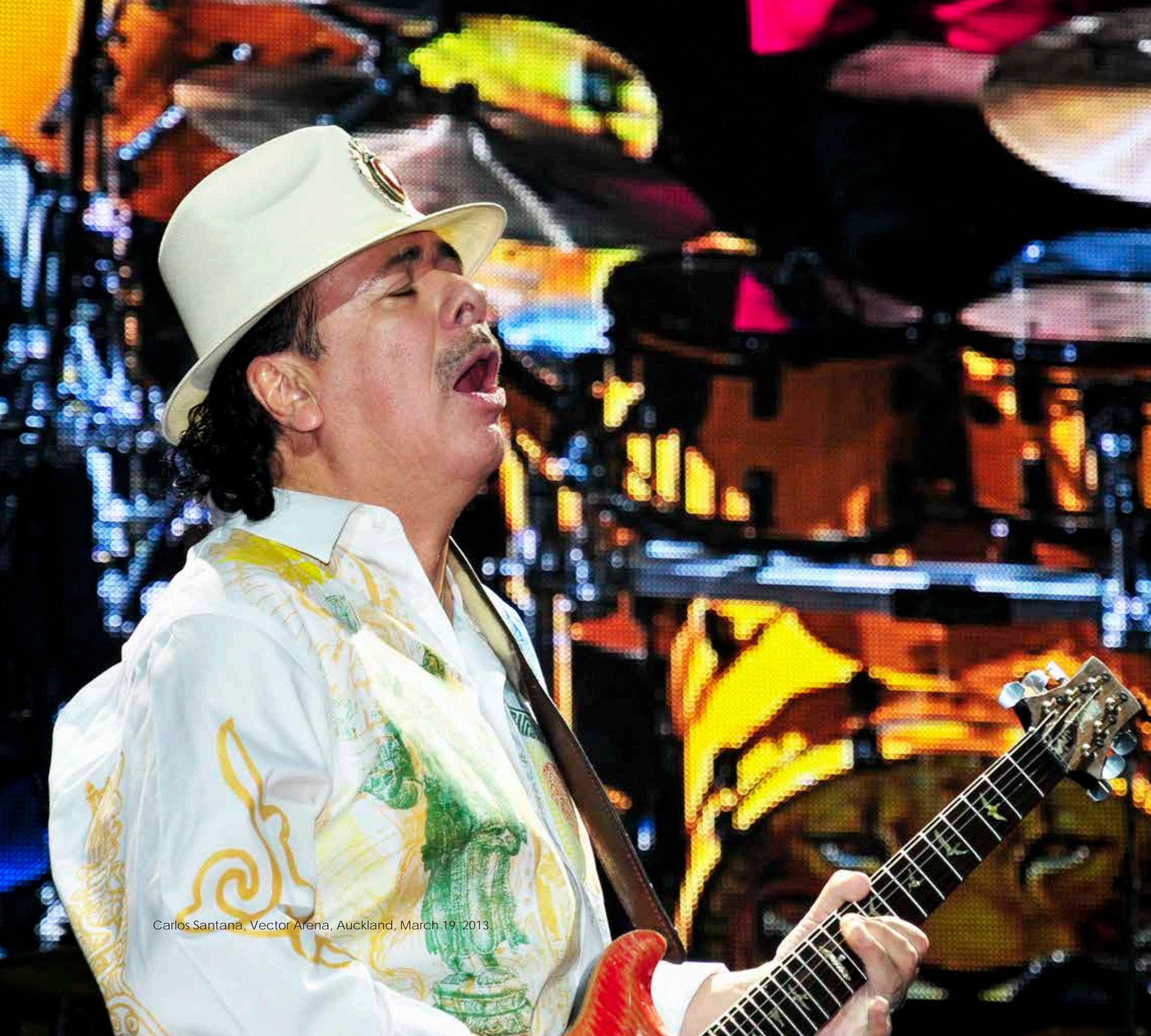
Carlos Santana, Vector Arena, Auckland, March 19, 2013.