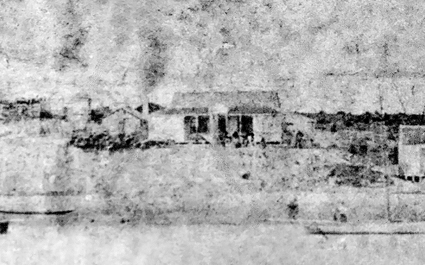
and their late 1860s house, seen in an early photograph, is now a Heritage New Zealand property.